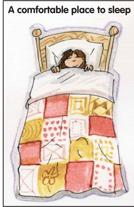
A comfortable place to sleep