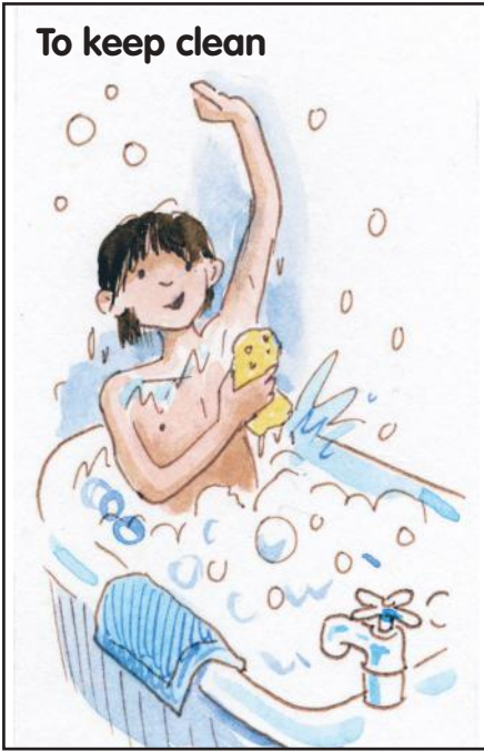
To keep clean