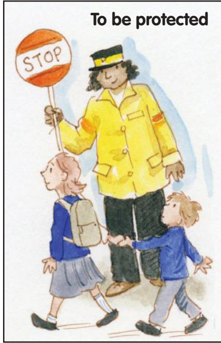
To be protected