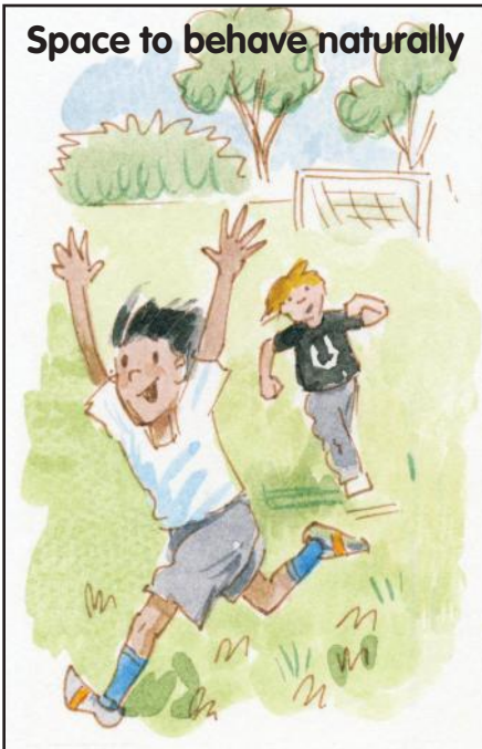
Space to behave naturally